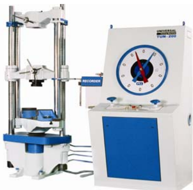
Analogue Version of UTM